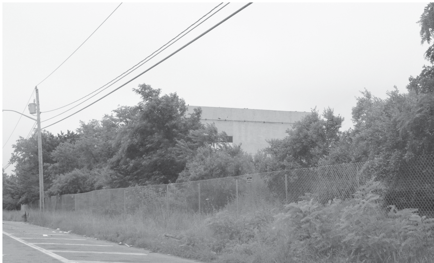
A hockey arena, which would not require a change of zone, has been proposed at the former movie theater in Medford, 440 South Service Road, a $130 million alternative project to the planned automobile wholesale operation.

"Madison Square Garden is a very expensive facility for a team that only draws about 4,000 people during the regular season to a game and about 6,000 during the