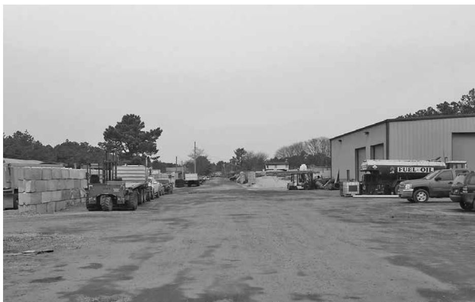
Brookhaven Town seeks to clean up Munsell Road in Medford.